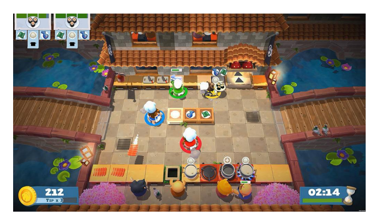
[Similar visual style and camera perspective to Overcooked]